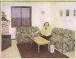
Safe Havens is a secure facility where parents can visit their children with supervision.